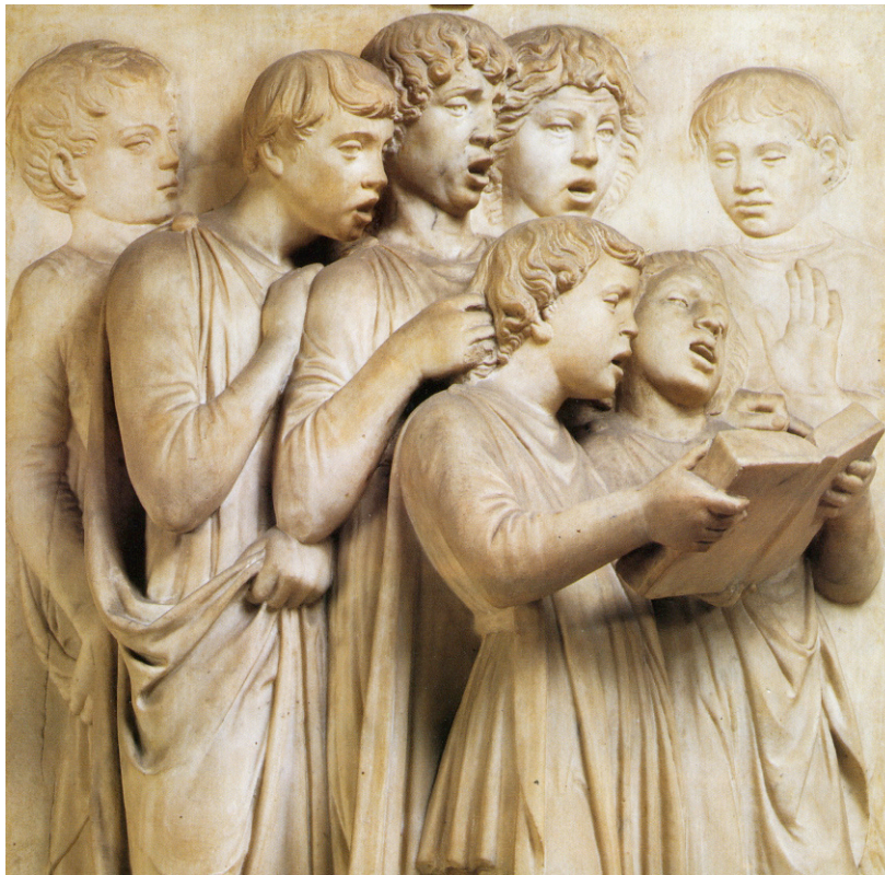
Luca della Robbia, Cantoria(1431-38)(Detail) Florence, Museum dell'Opera, dell Duomo.